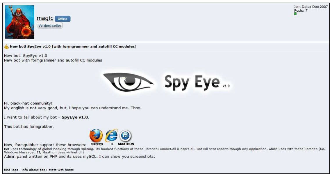
Fig. 1 – Sale SpyEye in underground forum

This statement is easily verifiable, as when he launched SpyEye earlier this year, as usual through underground forums. Gribodemon commissioned the distribution of the crimeware by "Magic". Here is a screenshot with some of the information.